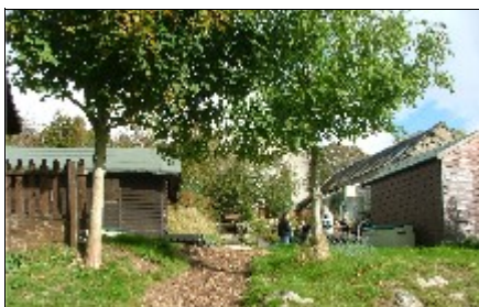
The Pine Forest Arts Centre

The Pine Forest Art Centre must be one of the more remote of the organisations working in the County. It is tucked away at the foot of the Two Rock Mountain beside the Glencullen River and just north of the Wicklow border. It is a mile or so west of that well-known South Dublin landmark – Fox's pub. The centre runs a series of Art and Crafts Courses each summer for Junior (5 – 12), senior (13-16) and portfolio preparation course (16 – 19). Each course is for two weeks and there are usually five courses each summer. There are also day trips from schools during normal school terms