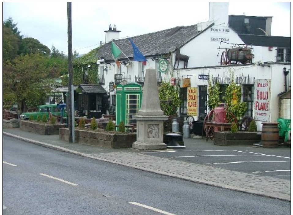
Johnnie Fox's Pub, Glencullen

Each organisation approached was asked to identify any specific requirements which seem to be hampering them in providing their service. A clear majority stated that their meeting venues did not provide adequately for their needs with quite a number of comments calling for a serviced community centre. Surprisingly, nearly 40% of the organisations had no specific needs or requirements!