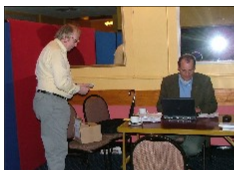
Counting the votes