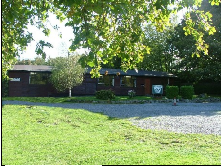
Kilternan Country Market

The market is one of a network of country