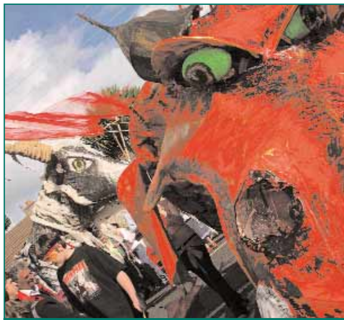
Dragon and Goat on the streets of Dalkey during the Dalkey Pageant

An extensive outreach programme is also underway and takes the company to schools all over south Dublin until the end of December. This educational theatre programme provides workshops in Deilig Inis' style of physical storytelling with a seasonal twist and involves young people in the creative process of theatre-making.