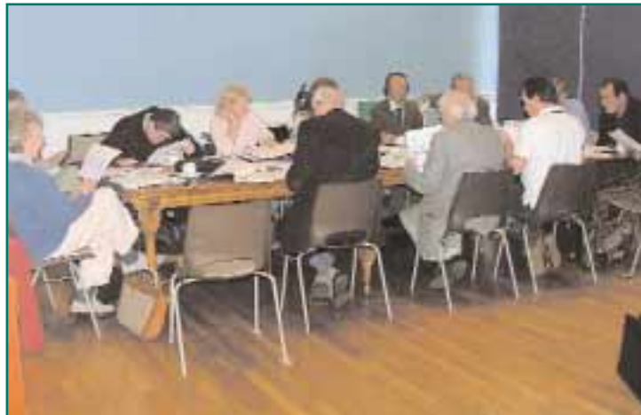
Working Group in Session

The Working Group will continue to work on behalf of the membership, to ensure that issues of mutual concern are voiced in the development of our County. Your active involvement in our work plan, and continued support for the Community and Voluntary Forum will ensure that your voice is heard.