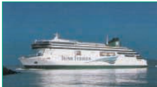
The Ferry Boat Ulysses

M embers of both the Forum Working Group and Strategic Policy Committees (SPC) spent an informative and diverting training day on 7 October aboard the Irish Ferries Ulysses on a return trip to Holyhead.