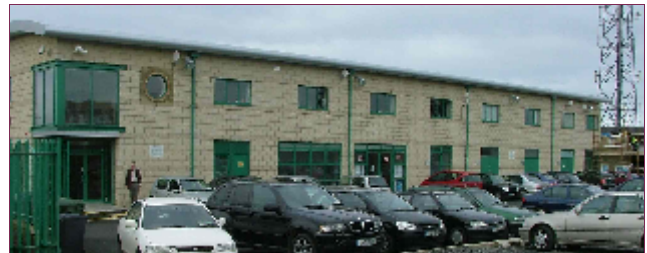
Nutgrove Enterprise Park