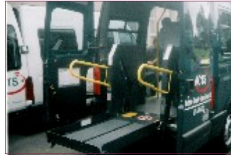
Special Vehicle Access

1800 211 311 or 01 494 8332 or 01 494 8333. and is anxious to expand the numbers of people it serves. Membership of the Travel Club is available for a nominal fee and fares paid thereafter are at a competitive rate.